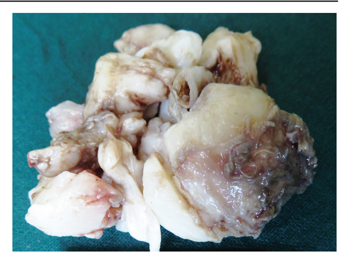
Fig. 2: Gross specimen showing a rubbery, gelatinous soft tissue mass

The OM is a rare aggressive intraosseous lesion derived from embryonic mesenchymal tissue associated with odontogenesis and primarily consisting of a myxomatous ground substance with widely scattered undifferentiated spindled mesenchymal cells.<sup>5</sup> According to the World Health Organization, OM is classified as a benign tumor of ectomesenchymal origin with or without odontogenic epithelium.<sup>10</sup> Histogenesis of OM has been a subject of debate since long. They are postulated to originate from